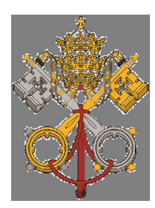
PONTIFICAL MISSION SOCIETIES IN THE US

Sponsored by the Missions Office of the Archdiocese of Seattle and the Pontifical Mission Societies in the United States