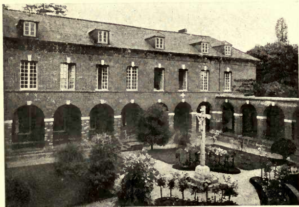
THE CARMEL QUADRANGLE.