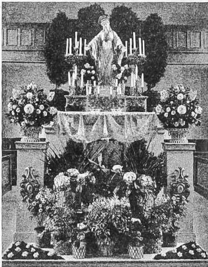
The altar of the Blessed Virgin

Let us hear the Mistress of catechism again: "To prepare for her First