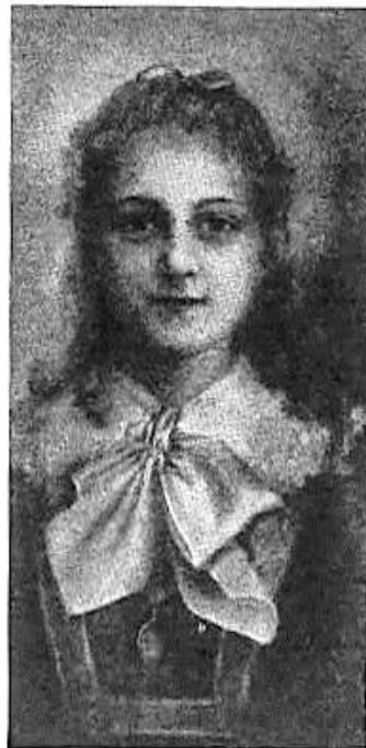
St. Thérèse in 1883

In the class there was one pupil of limited intelligence, very backward and mortified at finding herself with little girls much younger than she. It is not surprising that she became jealous of the successes of her youngest