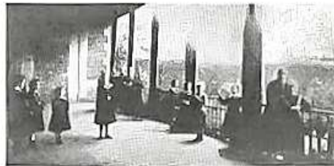
(From an old photograph)

This precious crucifix is to be seen in the Oratory of the Souvenirs.