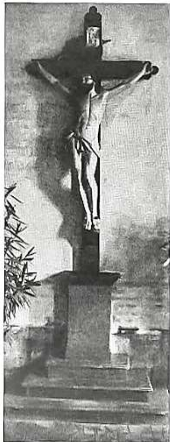
The crucifix in the cloister Thérèse, standing on tiptoe on the third step, would kiss the wounded feet.

(EDITOR'S NOTE: The longed-for day was that of the Little Flower's First Communion, May 8, 1884. Next month the Golden Jubilee of this event will be celebrated solemnly in the Benedictine Sisters' Abbey where St. Thérèse first received the Blessed Eucharist, and also in the Carmelite monastery where her life as a religious was lived. Our May issue will give the Benedictine Sisters' recollections of this notable event in the life of the patroness of foreign missions and the greatest of modern saints.)